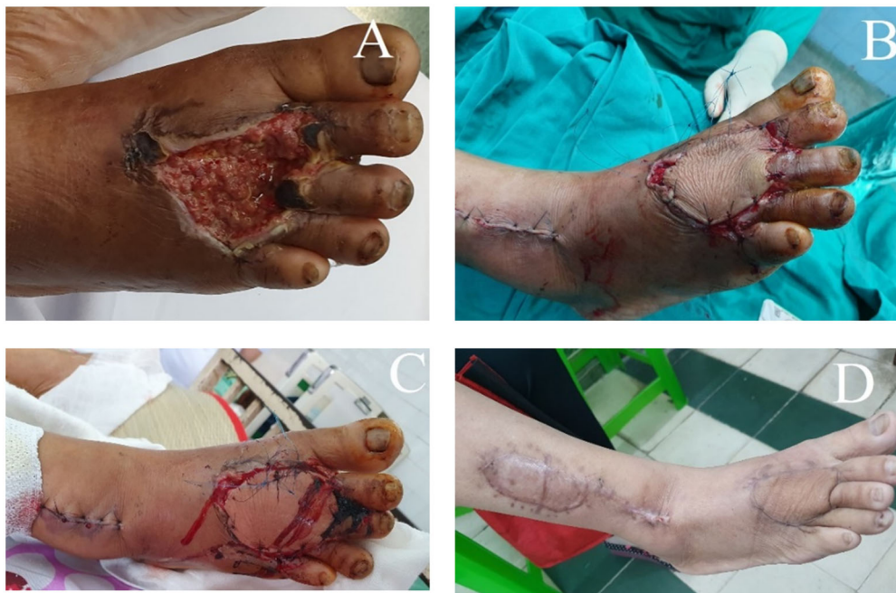
Figure 4. The forefoot defect was treated by a retrograde flow pattern and got successfully. (A) a wound in the forefoot, (B) Flap inset given, (C) Flap stable in 3 days after the surgery, (D) Late postoperative view.