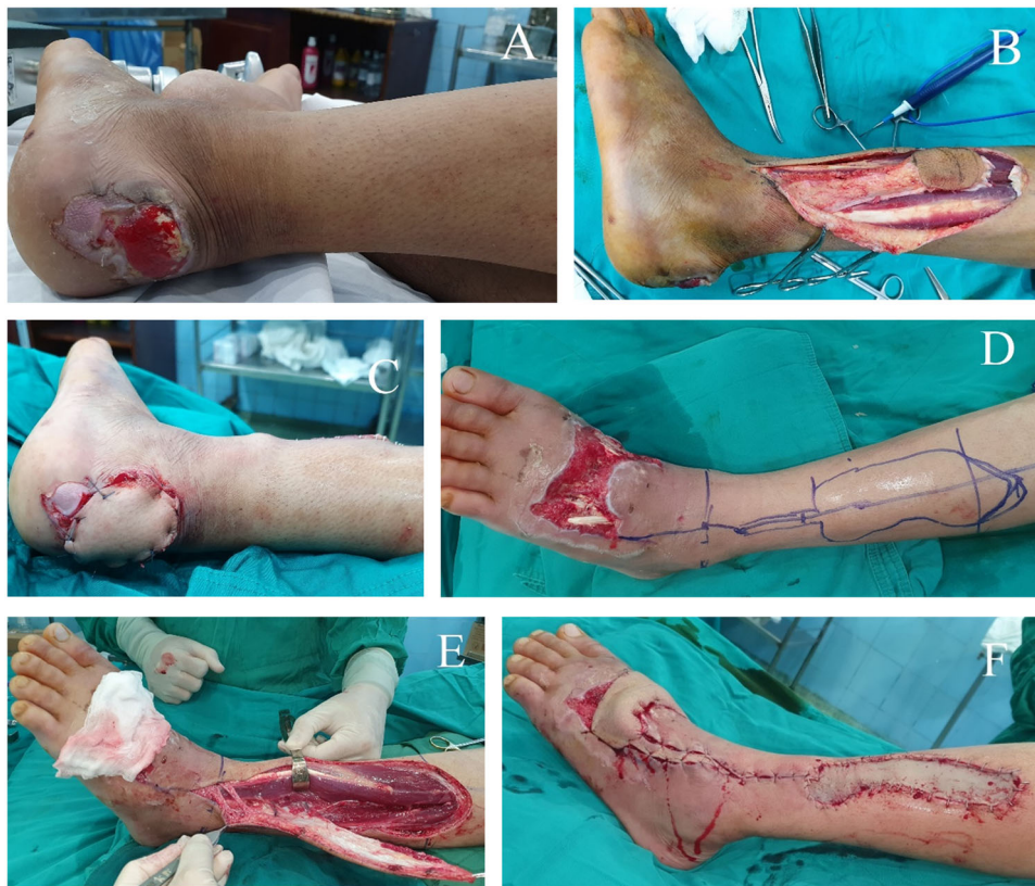
Figure 2. Intraoperative photographs of elevated flaps. (A–C) The mix blood supply pattern with subcutaneous pedicle, using under skin tunnel technique to inset the pedicle. (D–F) The retrograde manner with 3 cm wide subcutaneous pedicle, including 1 cm skin in the middle of the pedicle, incised ceiling skin tunnel to inset the pedicle.