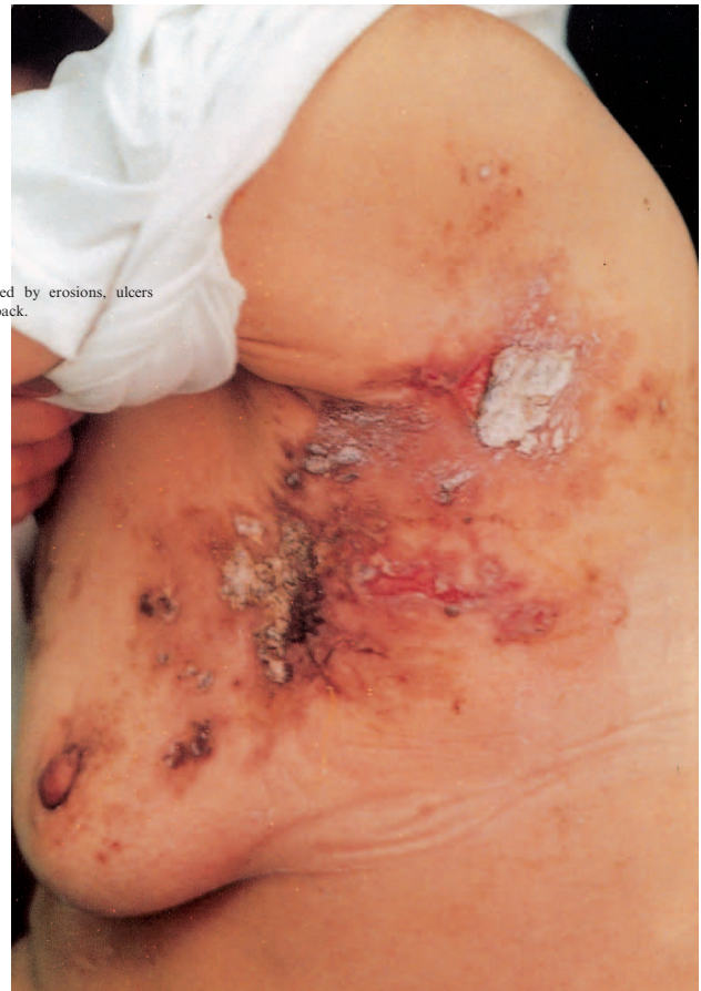
Fig. 1. Numerous vesicles have been replaced by erosions, ulcers and crusts along the left side of the chest and back.

The main causes of primary pneumothorax are ruptures of vesicles or cysts in the superior lobes of the lung and defects of pleura. It is more frequent in young men, with a prevalence six times higher than in women. It is likely to occur more frequently in winter in tall and skinny body types and in smokers, and manifests with sudden chest pain and dyspnea. Secondary pneumothorax is seen in patients with asthma, chronic obstructive pulmonary