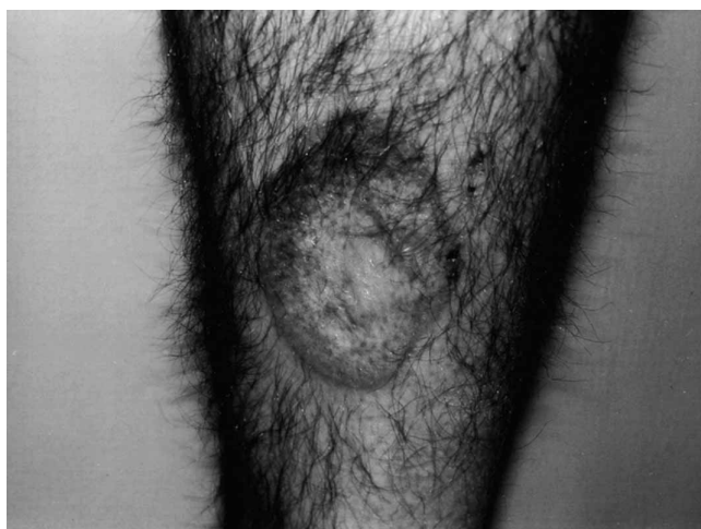
Fig. 1. Clinical aspect of the lesion. Subjacent vascularization could be observed through the atrophic, hypopigmented, hairy-free centre.

Actinic granuloma (AG) was first described by O'Brien in 1975 (1) and confirmed by Toribio et al. in 1978 (2) as asymptomatic annular lesions similar to those of granuloma annulare that spread on sun- or heat-damaged skin. It is characterized histopathologically by giant cell elastophagocytosis in the active border, loss of elastic fibres in the inner and a prominent actinic elastosis surrounding the annular plaque. The term 'actinic' indicates its external or environmental origin, embracing every form of electromagnetic radiation such as ultraviolet, visible light, infrared and X-ray (1). In 1979, Hanke et al. (3) described a similar picture in non-sun-damaged skin as annular patches with erythematous borders and hypopigmented centre but without solar elastosis, namely AEGCG. The authors rejected its actinic origin as they did not find actinic damage at the site of the lesions and it remains as an entity with unknown aetiology. Main histological changes taking place in AEGCG include the presence of giant cells, granulomatous inflammation and loss of