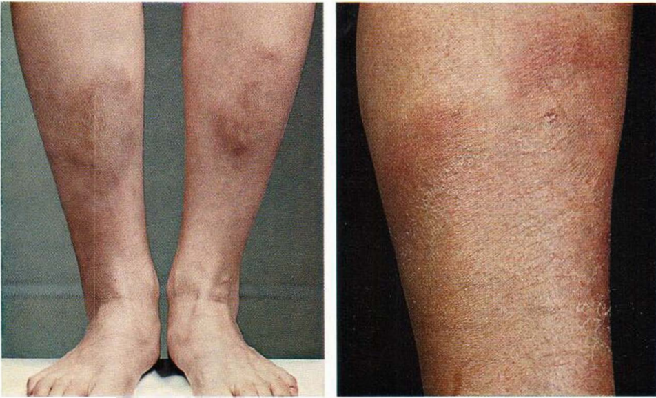
Fig. 1. (a) Centrifugally spreading nodules on both legs. (b) Migrating nodules on the right leg only. The original node has already disappeared.

for the chronic variant of erythema nodosum (6).