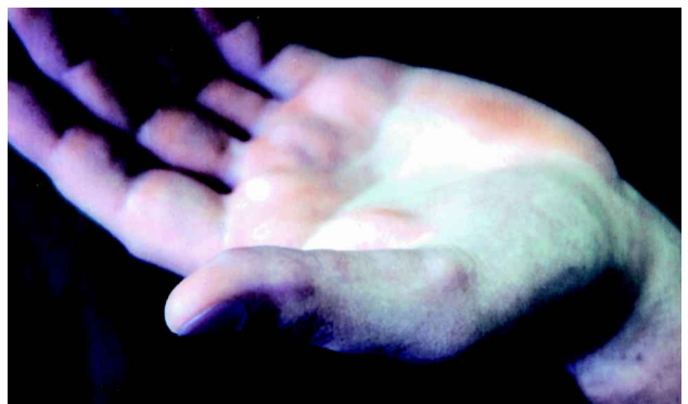
Fig. 1. A nodule on thenar surface of the left hand.

Laboratory routine tests were normal. Rheumatoid factor, urine hydroxyproline level, anti- Borrelia antibodies, fluorescent antinuclear antibodies, anti-ds-DNA, anti-Scl-70, anti-RNP, anti-Ro, anti-Jo-1 were all negative. X-rays of both hands and feet showed metacarpophalangeal, proximal interphalangeal, distal interphalangeal and metatarsal-phalangeal well-defined subcortical erosions. Radiographs of the chest, elbows, wrists and knees showed no abnormalities. Nail fold capillary microscopy showed normal capillary density (10 cap/mm) without oedema and haemorrhages; there