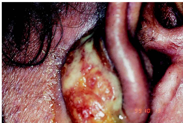
Fig. 1. A retroauricular soft cutaneous nodule with erythema and a yellowish discharge.

A 7-year-old girl was admitted to the Department of Dermatology with large (2–3 cm) soft masses rising from the left nostril and from behind the right ear (Fig. 1). Her history included severe eczema, recurrent pneumonia with pneumatocele, skin abscesses and high levels of IgE (peak 4000 IU) documented on repeat