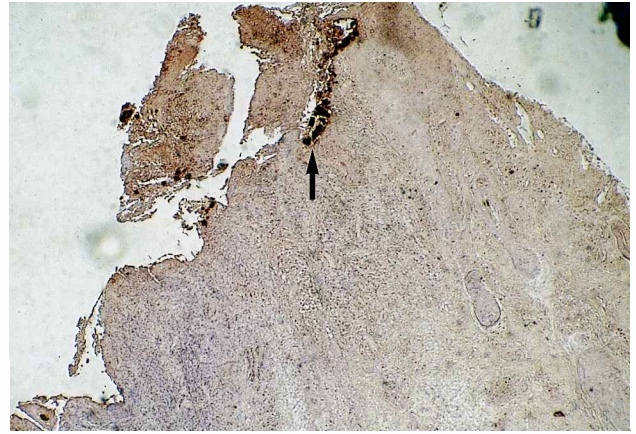
Fig. 3. Skin biopsy demonstrating an epidermal erosion and numerous enlarged cells positively stained for HSV (shown by the arrow). (Herpes simplex virus type I immunoperoxidase and hematoxylin counterstain; original magnification \times 175 ).

In conclusion, we believe that T-lymphocyte studies should be considered in hyper-IgE patients. In the case of persistently decreased CD4, long-term or even prophylactic anti-viral therapy may be warranted.