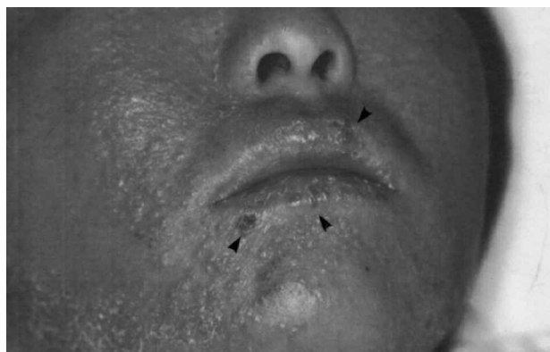
Fig. 2. Encrusted vesicles around the mouth (arrows) and many vesicles on the face.