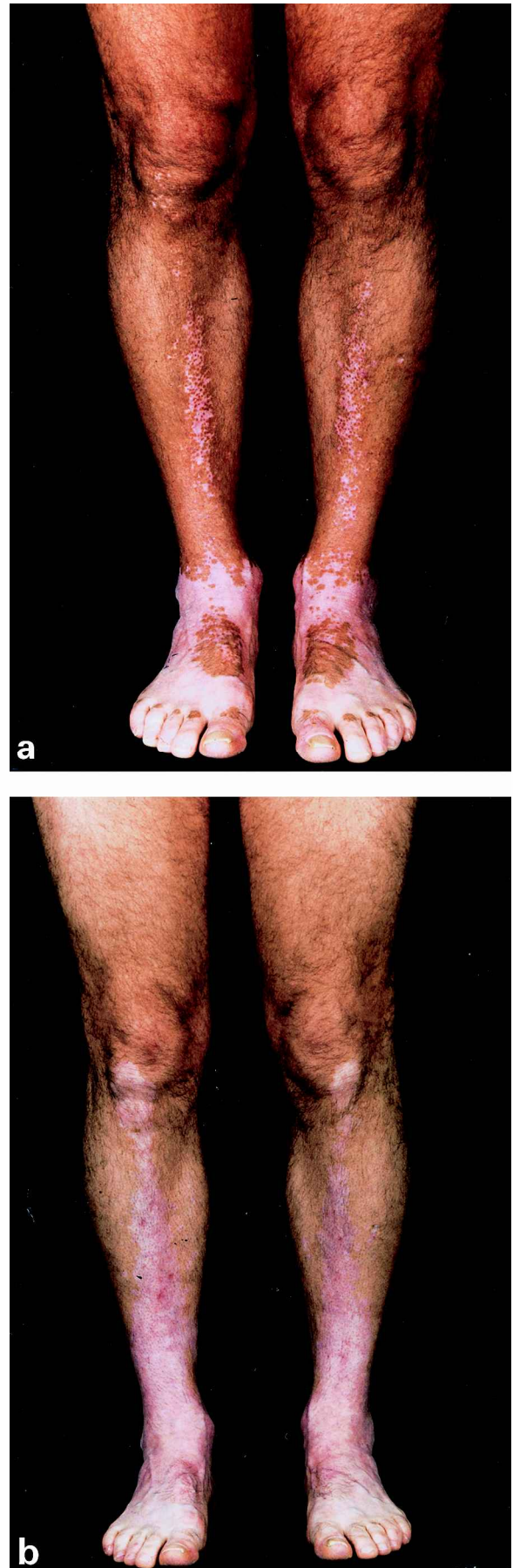
Fig. 2. Before (a) and after (b) photographs of a vitiliginous area on the lower legs and feet of a patient. Note the minimal repigmentation on the feet and ankles. Patient was treated with narrow band UVB alone. Photographs were taken after an interval of 12 months.

Although no large studies and no controlled studies have been done, narrow band UVB has been proven in some studies to be effective in inducing repigmentation in patients with vitiligo (8, 23, 26). Our study shows that narrow band UVB treatment results in an up to 100% repigmentation of depigmented lesions in 92% (25/27) of patients with long-term stable vitiligo vulgaris. During this treatment period no relapse was seen and apart from some prickling sensations, usually on