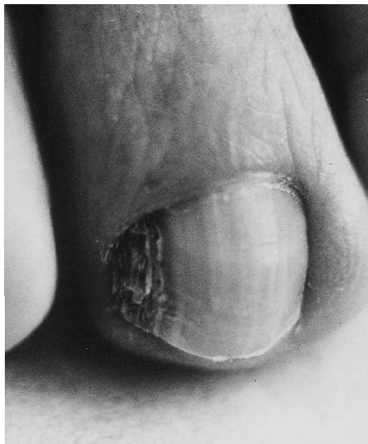
Fig. 1. Case 1: dark-brown discoloration. Trichophyton mentagrophytes associated with onychomatricoma.

A 24-year-old woman was concerned by the appearance, 1 year prior to consultation, of a brown pigmentation of the medial third of the great toenail. At first glance we suspected a frictional longitudinal melanonychia. One year later the area of pigmentation had become enlarged and a distal fissure was visible at the border between the normal and affected nail (Fig. 2a). Dermoscopy examination revealed that the external border of the darkened area was yellowish and we suspected the existence of an underlying onychomatricoma. The abnormal portion of the nail was removed, showing a tumour emerging from the matrix (Fig. 2b) and the characteristic proximal holes of the nail plate observed in onychomatricoma. Histology confirmed the clinical diagnosis.