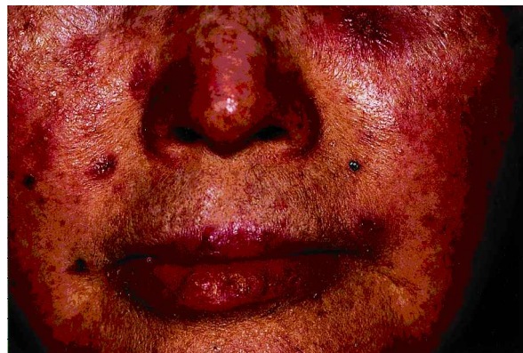
Fig. 1. The presence of basal cell carcinoma and squamous cell carcinoma.

A 54-year-old Japanese female presented with numerous pigmented spots on her exposed skin and some tumors on her face. The pigmented spots had appeared when she was aged 7 years and the tumors had developed just a few years before the present examination. Based on the lack of any neurological symptoms, as well as her past history of lesions on exposed skin, she was suspected of having the variant type of XP. Her parents were not consanguineous and none of her family members, including 2 sons aged 30 and 25 years and a 1-year-old granddaughter, suffered from XP. Physical