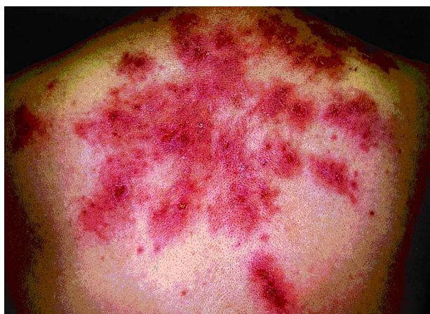
Fig. 1. Irregular, confluent, erythematous plaques with small crusted erosions present on the upper back. Reddish papules (1–2 mm diameter) are seen scattered on and close to the erythematous lesions.

urinalysis, liver function, serum creatinine, serum protein electrophoresis, IgG, IgA and IgM. Urine was negative for ketones.