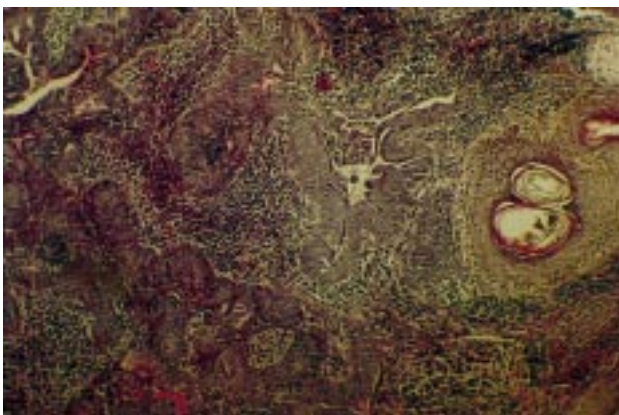
Fig. 3. Section of excised papule of BCC showing islands of basaloid cells attached to the epidermis (at the right edge of the section) with dense chronic inflammatory cell infiltrate in the stroma. (H & E stain \times 100 ).

frequently in naevus sebaceus and syringocystadenoma papilleferum, but rarely in verrucous epidermal naevi (1). To the best of our knowledge, only 7 case reports, comprising 8 patients (7 men and 1 woman), have so far been published in the world literature in which BCC appeared in a verrucous epidermal naevus (2–8). Five of these cases are from western countries and one from Japan. All of the patients had fair skin. Verrucous epidermal naevus was present on the exposed areas of the body in 5 patients (2, 4–6). The naevi were localized in 3 patients (4, 6) and extensive or generalized in 4 patients (2, 3, 5, 7). Multiple BCCs arose in 4 patients (3–6). In 3 patients, squamous cell carcinoma also developed along with BCC within the verrucous epidermal naevus (2, 3, 8). A history of preceding trauma, such as excision, electrocautery,