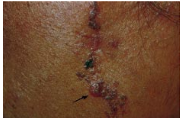
Fig. 1. Plaque of localized linear verrucous epidermal naevus with a recently visible dome-shaped papule of basal cell carcinoma (arrow).

Verrucous epidermal naevus are circumscribed developmental (hamartomatous) lesions comprised of keratinocytes (1). BCC is a known complication of epidermal naevi. It occurs more