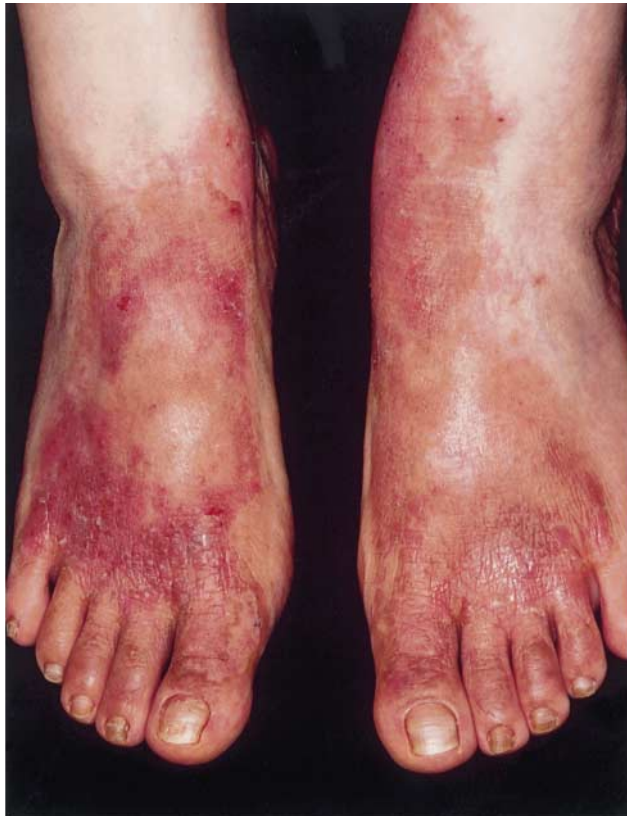
Fig. 1. Symmetrically distributed annular erythematous plaques with central clearing on the dorsa of the feet.

Closer examination revealed some minute pustules underlying the inner collarette of scales and crusts on the spreading margin of the lesions. As the lesions progressed peripherally, they slowly resolved with central hyperpigmentation. There were no other skin lesions elsewhere. She had no family history of similar eruptions or of atopic eczema. Repeated KOH examination and fungal culture were all negative. A bacterial culture demonstrated a moderate growth of coagulase-negative staphylococci. A routine patch test revealed no positive reac-