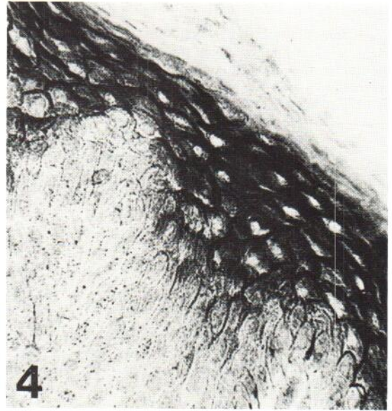
Fig. 4. Psoriasis, immunostained for OKM5 (CD36) ( \times 400 ).

In this study, we do not find in vivo keratinocyte CD36 expression in clinically normal skin. This is in