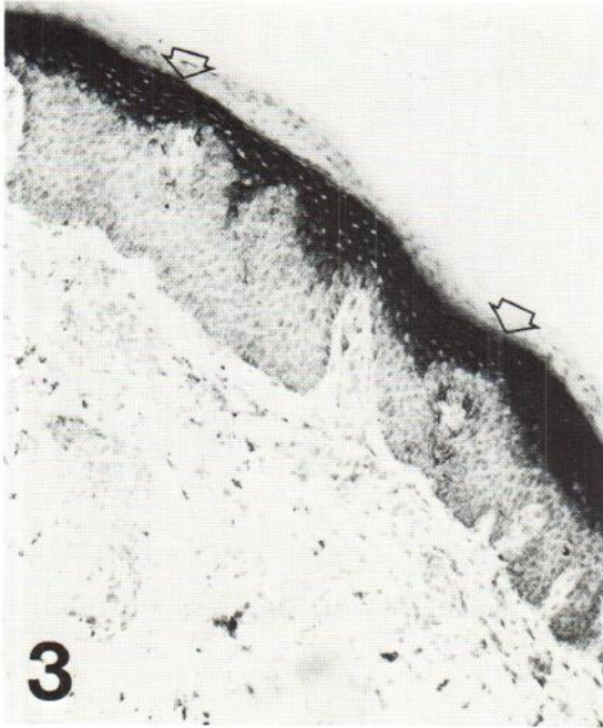
Fig. 3. Psoriasis immunostained for OKM5 (CD36). Arrows indicate OKM5 (CD36) staining ( \times 100 ).

Skin biopsies from allergic patch-test reactions, obtained at 4 hr, 48 hr and 72 hr also contained CD36 + dendritic cells. These cells were present in the basal/suprabasal layers of the epidermis (Fig. 2). Similar, CD36 + cells were also seen in mycosis fungoides (Fig. 5).