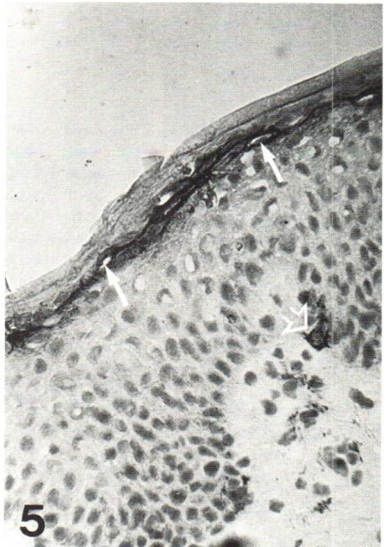
Fig. 5. Mycosis fungoides. Closed arrow: CD36 + keratinocytes. Open arrow: Dendritic cell stained positively for OKM5 (CD36) ( \times 400 ).