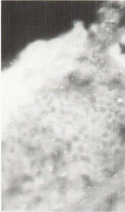
Fig. 2. Normal guinea pig oral mucosa reacted with absorbed anti-Sephadex fraction II rabbit sera and stained with FITC-labelled anti-rabbit 7S gammaglobulin. The photograph shows intercellular staining. \times 400 .