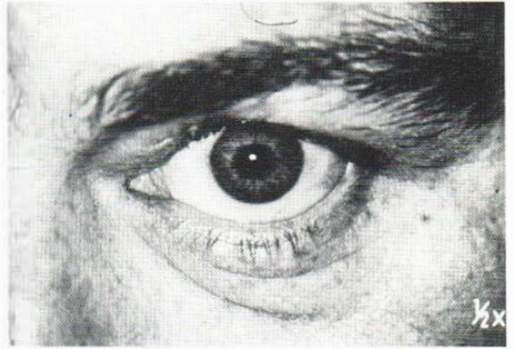
Fig. 4. Case 2. Palpebral cellulitis cured after treatment with tetracycline and prednisone.

tion may reach the brain and cause meningitis, thrombosis in the cavernous sinus, cerebral or subdural abscess (2, 3).