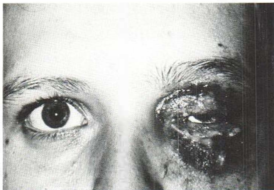
Fig. 1. Case 1. On admission to the hospital. Swelling, erythema and erosions of the eyelids on the left side.