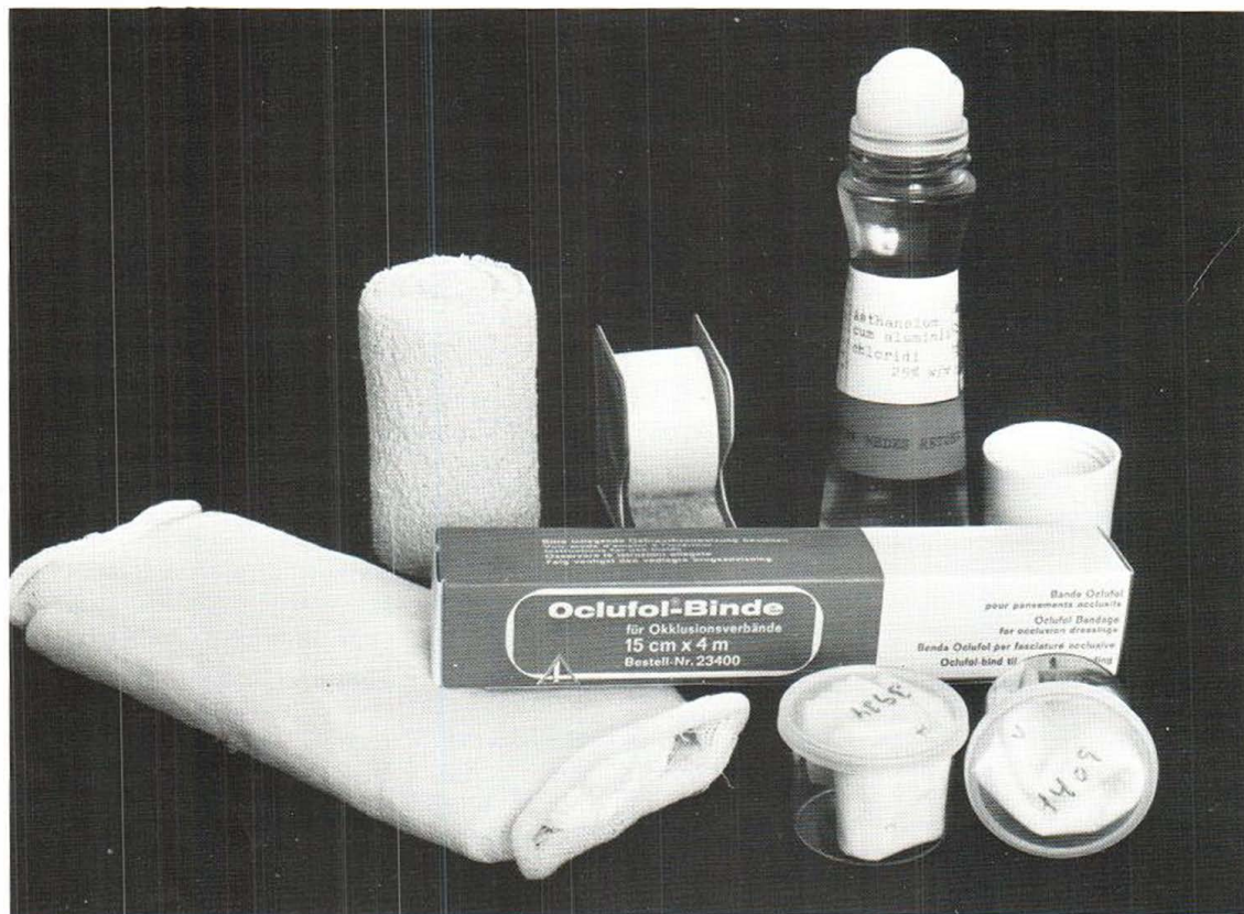
Fig. 1. Still-life with roll-on applicator and the remedies used for occlusive dressing and sweat collection.

this purpose. Ten patients in group II had considered surgery and 2 were referred to the dermatological department therefor.