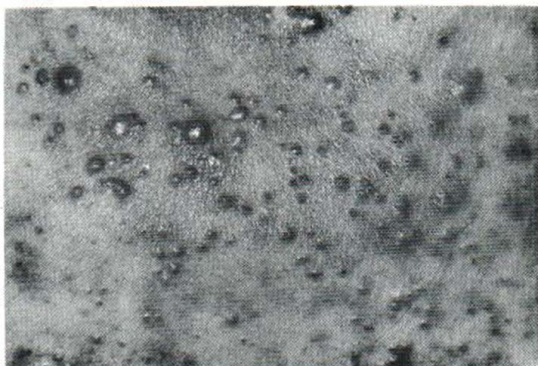
Fig 2. Close-up of acne elements on the chest.

The patient's reaction to the gold treatment was peculiar and unusual. The case history shows that gold treatment even in the same patient may cause a