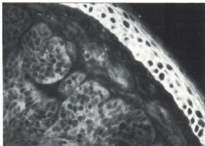
Fig. 2. Immunofluorescence pattern of a solid basal cell carcinoma incubated with FTC-labelled antihuman beta-2-microglobulin at a dilution of 1:10. The normal epidermis above the tumour shows an intense, interepithelial fluorescence, while the basal cell carcinoma tissue shows no fluorescence.

1. These antigens, when present on the cell surface of the malignantly transformed cells, could become reorganized into patches instead of being distributed evenly. However, beta-2-m would then be detectable in certain sections. The failure of the