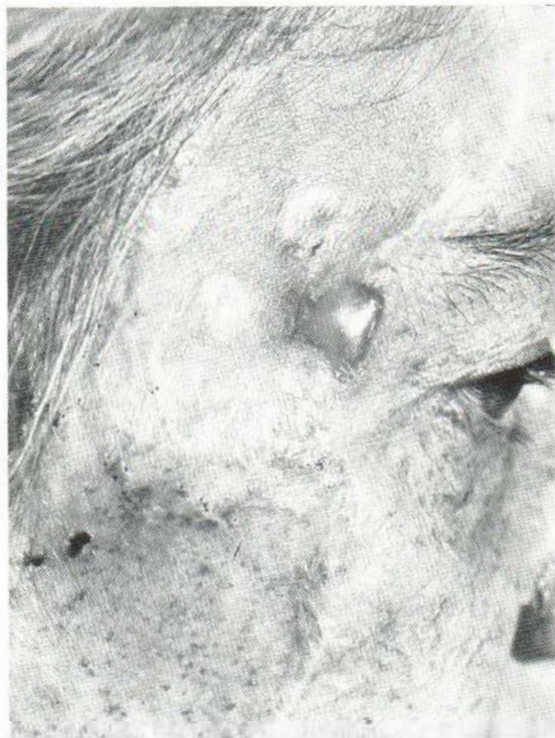
Fig. 1. Bullae and scarring on skin-grafted area of the right temple.

Prednisolone 10 mg b.d. and Azathioprine 50 mg b.d. were given for 2 months but with no effect. The patient is currently applying Dermovate® (Glaxo) to the lesions and taking Azathioprine 50 mg three times a day.