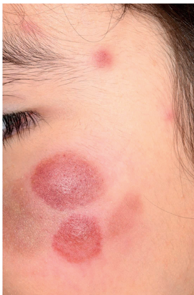
Fig. 1. Asymptomatic, red-brown, haemorrhagic plaques and nodules of different sizes on the face of an 8-year-old girl.

The biological behaviour of BPDCN is usually aggressive, often with a fatal outcome within months (4). This contrasts with the initial, often innocuous, clinical presentation with merely cutaneous involvement, as in the current patient. Interestingly however, the prognosis of BPDCN is assumed to be better in paediatric patients. An immediate haemato-oncological referral and multidisciplinary management is warranted. Due to the rarity of the disease, no standardized therapy exists currently, most of the studies are of retrospective nature, and the vast majority of patients included are elderly adults. Treatment with high-risk ALL-type, as well as AML-type chemotherapy regimens, appears to be effective. Aspa-MTX containing regimens achieve the best response rate with a lower toxicity profile, possibly paving the way for HSCT and eventual long-term complete remission of the disease (5). However, another report suggests that