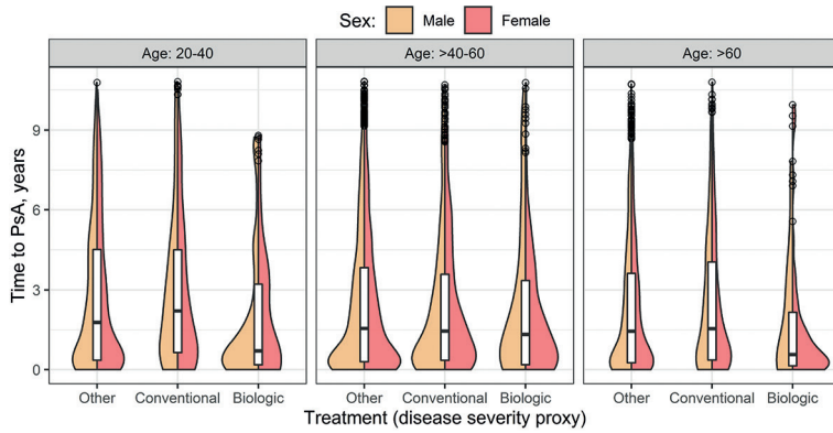
Fig. 3. Distribution of time to onset of psoriatic arthritis (PsA) in patients with skin psoriasis (PsO) by disease severity proxy, sex and age. Violin plots illustrating the distribution of time to onset of PsA for those with PsA events stratified by disease severity proxy, sex and age. The box plot inside each violin plot displays the median, and the first and third quartiles. The upper line extends from the upper edge of the box to the largest value no further than 1.5 times the inter-quartile range (IQR, the distance between the first and third quartiles) from the box. The lower line extends from the lower edge of the box to the smallest value at most 1.5 times the IQR from the box. Data beyond the end of the lines are outliers and plotted individually as circles. Time to onset of PsA was fastest for biologic-treated female patients with skin PsO aged >60 years, followed by biologic-treated female patients with skin PsO aged 20–40 years, followed by biologic-treated male patients with skin PsO aged 20–40 years, and longest for male patients with skin PsO aged 20–40 years treated with conventional systemics or other treatment.

first observed PsA diagnosis, in line with previous literature (20). Relative to patients' treatment, baseline characteristics, such as comorbidity, age and sex, were associated with risks of lower magnitude. However, these factors are still important, and the analysis of treatment as proxy of disease severity stratified by a wider age spectra (20–40, >40–60, and >60 years) and sex found that females receiving biologics aged > 60 and 20–40 years, respectively, were associated with the highest risk of receiving a first observed diagnosis of PsA. These findings were consistent with certain previous findings where females were associated with a higher risk of onset of PsA (16). Hypertension, diabetes mellitus, depression, anxiety, malignancy and coronary heart disease were the most common comorbidities in the overall study population. These are typical comorbidities of patients with skin PsO (22, 32).