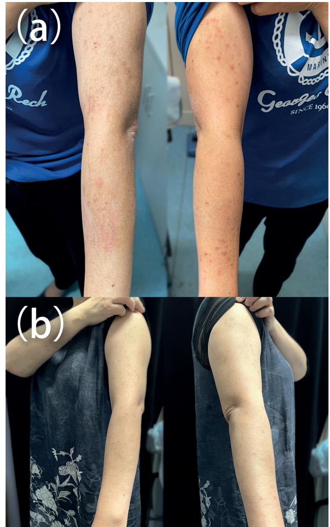
Fig. 1. (a) Dry, cracked, scaly skin with diffuse lichenified papules and nodules was visible on the arms prior to dupilumab treatment. (b) Total clearance of lesions after 5 months of dupilumab treatment.

to improve her condition. Systemic immunosuppressors were not considered because of safety concerns in cancer patients (5). Dupilumab was initiated at a 600 mg loading dose, followed by 300 mg biweekly. One month later, a significant decrease in severity, and improvement of pruritus-NRS 3/10, was observed. After 5 months of dupilumab therapy, the patient showed remarkable numerical improvement (SCORAD 12.2, EASI 3.4, pruritus-NRS 0/10), and no side-effects were observed. Physical examination showed only xerosis and pigmentation on her upper limbs (Fig. 1b). In addition, at follow-up in the Department of Haematology, the patient reported a stable condition, without recurrence of NHL.