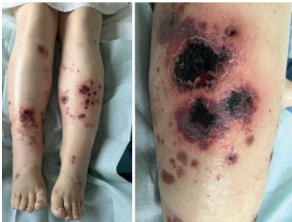
Fig. 1. Lower-limb purpura 3 months after onset of symptoms.

A 54-year-old woman who had axial and peripheral PsA for 6 years was referred to our dermatology unit for cutaneous purpura progressing for 3 months, recently associated with febrile diarrhoea. Previous treatments for PsA included methotrexate alone, then methotrexate plus adalimumab. After one year of treatment with adalimumab and methotrexate, she had developed paradoxical pustular palmoplantar psoriasis, which was controlled by topical steroids. Two years later, her PsA was no longer controlled and adalimumab was switched to secukinumab, in association with methotrexate, with rapid control of PsA. One month after starting secukinumab, the patient developed psoriasiform lesions on the vulva, with nodular and pustular purpura on the lower limbs. Secukinumab was stopped 2 months after onset. One month later, the patient presented sub-acute febrile diarrhoea with persisting necrotic purpura on the lower limbs (Fig. 1). Biological analyses showed normal platelet count, renal and liver function, elevated C-reactive protein level, and negative serology for HIV or hepa-