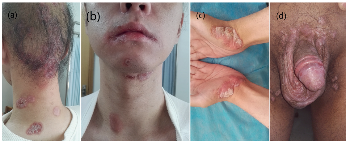
Fig. 1. a) Patchy alopecia and red psoriasis-like plaques on the patient's scalp and neck. b) Red plaques on the patient's neck and jaw and dry erythema on his lips. Several varisized red and flat-topped, hypertrophic, verrucous and psoriasis-like plaques on the patient's wrists (c) and genital area (d).

Physical examination revealed patchy alopecia and multiple varisized infiltrated flat red psoriasis-like plaques involving the scalp, neck, face, shoulders, feet and genitals ( Fig. 1 ). He had axilla, neck, submaxilla and groin lymphadenopathy. The T. pallidum particle assay was positive with a toluidine red unheated serum test titre of 1:64. His HIV viral load was 151 copies/ml, and his CD4 + T-cell count was 15 cells/μl. Cerebrospinal fluid tests indicated slightly elevated leukocyte (15 cells/μl) and protein levels (60 mg/dl), but the Venereal Disease Research Laboratory test was negative. A skin biopsy taken from a left wrist lesion revealed that the epidermis was irregularly proliferated, dermal papillae were oedematous, and perivascular plasma cells had infiltrated the superficial dermis ( Fig. 2a ). Immunohistochemical analysis using a polyclonal antibody against T. pallidum showed numerous spirochetes ( Fig. 2b ). The diagnosis of secondary syphilis and HIV infection was confirmed. The patient received 4 million units of benzylpenicillin intravenously every 4 h for 14 days. His skin lesions and