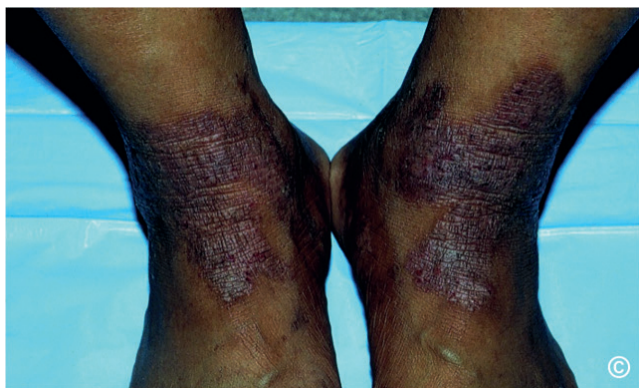
Fig. 1. Bilateral lichen simplex chronicus plaques on the flexural surfaces of the feet.

common in Asia, particularly in elderly patients (2). Those with a family or personal history of atopy may be more susceptible to LSC. Approximately 20–90% of people affected by LSC report a personal or immediate family history of atopic dermatitis, allergic rhinitis, and/or asthma (5). Psychosocial stress is also linked to severely pruritic dermatoses such as LSC, and patients demonstrate a significantly higher prevalence of psychosomatic and psychiatric comorbidities, such as clinical depression and anxiety. LSC often presents in high achievers with stressful and competitive lifestyles (6).