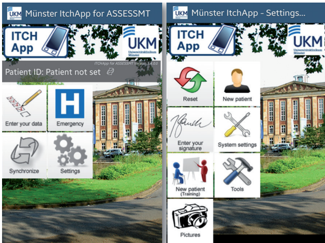
Fig. S1. The two main interfaces of the ItchApp®. The ItchApp®: an app based eDiary for the assessment of chronic pruritus in clinical trials.