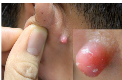
Fig. 1. Asymptomatic, solitary, 6–7-mm diameter, erythematous protruding nodule with a skin-coloured stalk located in the left posterior auricular region.

A 31-year-old Korean man presented with an asymptomatic, easy-to-bleed, solitary, rapidly enlarging, and erythematous protruding skin lesion with a stalk on the posterior auricular area, which he had first noticed 6–7 weeks prior to visiting our clinic (Fig. 1). In June 2010, the patient had been diagnosed with chronic myelogenous leukaemia, which was treated first with hydroxyurea and, since September 2012, had been managed with oral radotinib, 600 mg/day. The patient had no history of trauma and denied any family history of similar skin lesions. Our initial impression was pyogenic granuloma or accessory tragus. A skin biopsy showed a proliferation of small-to-medium-sized blood vessels with a cobblestone