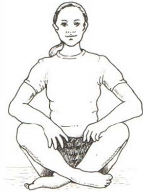
Fig. 1. Posture adopted by patients who developed 'crossed-leg callosities'.