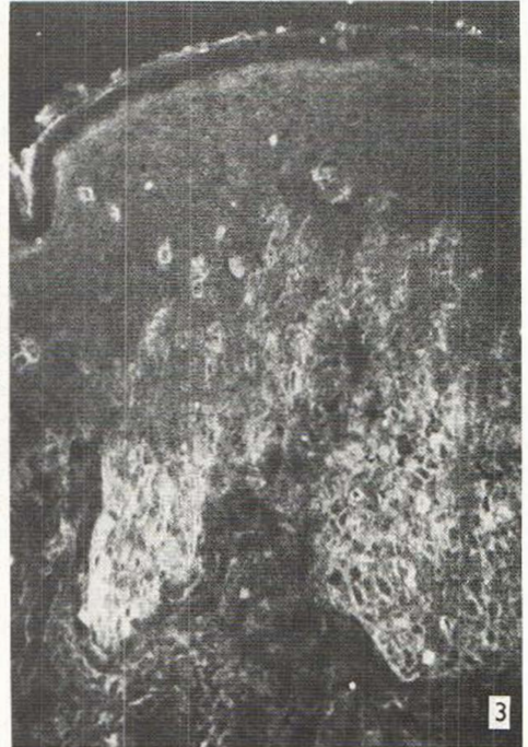
Fig. 1. Pagetoid reticulosis. Histological section showing an epidermal pagetoid cellular infiltrate. H & E, \times 500 .