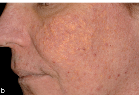
Fig. 1. (a) The patient's early phase acneiform reaction induced by cetuximab and late phase perifollicular xanthomatous reaction, presenting as (b) yellowish papules on the left cheek.