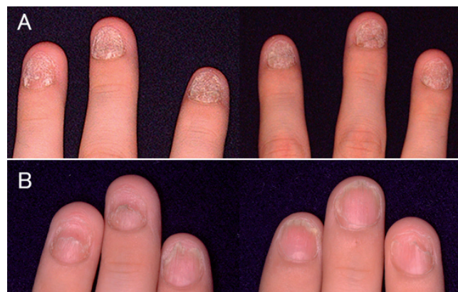
Fig. 1. (A) Nail lichen planus in an 11-year-old male patient before treatment. The fingernails show very severe thinning. The right-hand fingernails were treated with topical tacrolimus and the left-hand ones with diflucortolone valerate ointment twice daily (comparative application). (B) The same patient after 5 months of comparative application. Significant clinical improvement of the right-hand fingernails (right) was noted compared with the left-hand ones (left).

Topical corticosteroid therapy is commonly considered as a first-line treatment for NLP, although it is usually ineffective. Oral prednisone and intramuscular triamcinolone acetonide have been reported as effective against NLP (2–4), but prolonged or repeated use of