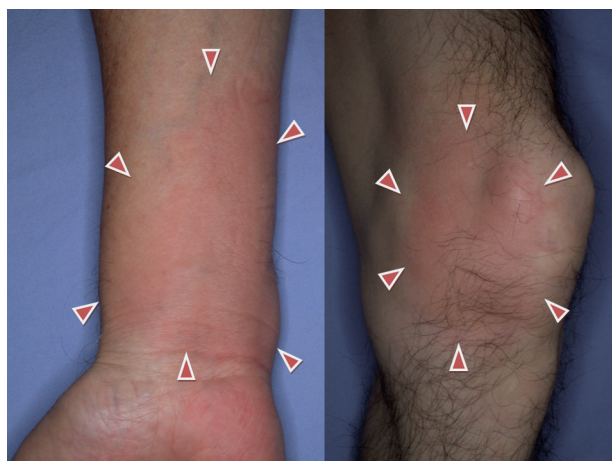
Fig. 1. Scarlet-coloured, oedematous lesions approximately 10 cm in diameter with a distinct border were observed on the patient's right distal forearm and left knee.