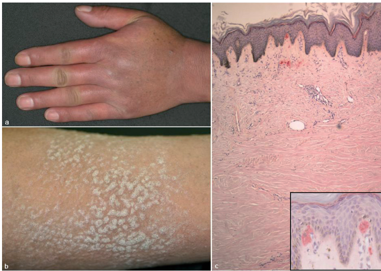
Fig. 2. (a) Raynaud's phenomenon in Case 2. (b) Multiple keratotic papules on the sclerotic forearms. (c) Histological features of irregular hyperkeratosis and amyloid deposition in the stratum papillary layers of the epidermis ( insert ) and the upper dermis of the overlying sclerotic dermis (Dylon) ( \times 40 ).

(1–6). Ogiyama et al. (5) reported 6 cases of cutaneous amyloidosis with scleroderma, 4 females and 2 males, and the involved sites were the upper back in all cases. Looi (2) reviewed 85 patients with PLCA, and revealed one scleroderma patient with papular amyloidosis. Summers & Kendrick (6) reported an unusual case that showed multiple nodular amyloidosis in a patient with CREST syndrome (calcinosis, Raynaud's phenomenon, esophageal dysmotility, sclerodactyly, and telangiectasia). Moreover, cases of sclerodermatomyositis (7) and generalized morphea-like scleroderma (8) exhibiting coexistence of PLCA have been reported.