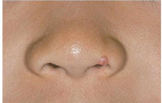
Fig. 1. A 3.5-mm diameter, flat-topped, slightly red-coloured, painless nodule on the left nostril.

There was no evidence of recurrence after 18 months.