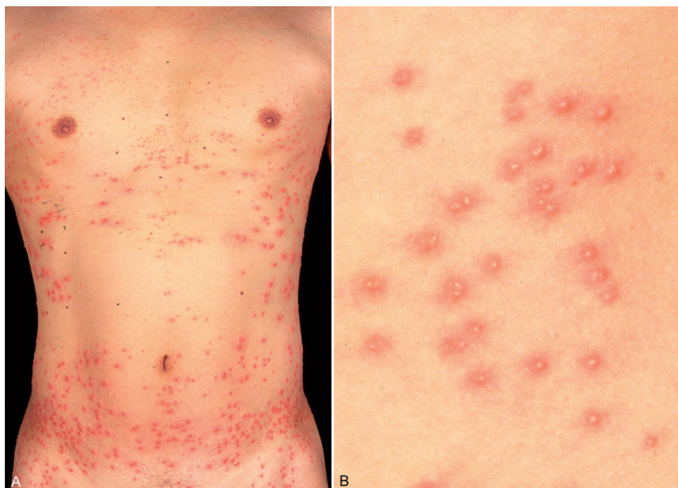
Fig. 1. Clinical manifestation. (A) Discrete pustules on the trunk. (B) Close up. Each eruption has a faint erythematous base and pustular centre.

He had had no prior illnesses, surgery, medication, or hospitalizations that would explain the condition. On physical examination the patient appeared to be healthy, except for multiple cutaneous lesions distributed on the trunk, thighs and upper arms. The lesions were 2–5 mm in size, each with a faint erythematous base and pustular centre (Fig. 1). The lymph nodes were not palpable, and there were no other abnormal findings on physical examination. Routine haematological and biochemical investigations revealed no abnormalities. The erythrocyte sedimentation rate (ESR) was 4 mm/h. On serological examination, C3d-containing circulating immune complexes were found to be increased, while C1q-containing immune complex and anti-streptolysin-O (ASO) were within normal limits. Antinuclear antibodies were negative. Chest roentgenogram and urinalysis were normal. Throat and rectal swabs were negative for streptococcus and neisserial species. Skin biopsy was obtained from a faint erythema, which appeared to be in its early stage (Fig. 2). Histological examination showed no abnormalities in the epidermis. However, from the papillary dermis to the reticular dermis small dermal blood vessels were infiltrated by neutrophils accompanied by occasional lymphocytes. There was minimal leukocytoclasia without fibrinoid degeneration