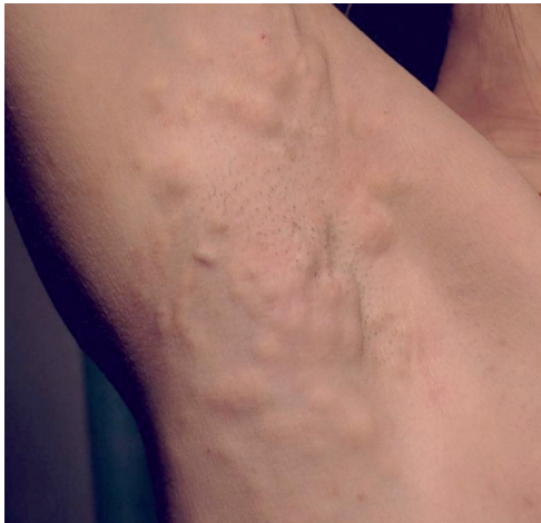
Fig. 3. Numerous smooth-surfaced, skin-coloured nodules in the axillary fold.

The histopathology of SM is characterized by the presence of empty cyst formed by a thin wall of stratified squamous epithelium without a granular layer. Sebaceous