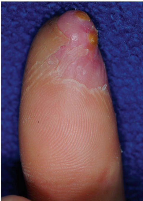
Fig. 1. A purplish nodule on the apex of the right thumb.

Grocott staining revealed septate hyphae with branches at the superficial necrotic areas and rarely in the dermal necrobiosis