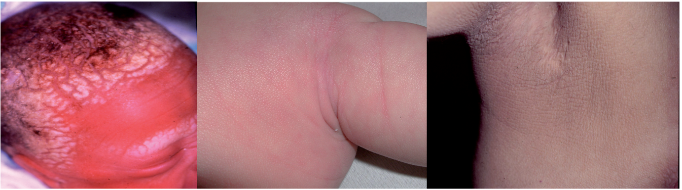
Fig. 2. Clinical characteristics of ichthyosis prematurity syndrome (IPS) soon after birth 6 weeks before term ( left ) and at 3 months of age showing a toad-like hyperkeratosis especially in the skin folds ( middle ). A similar appearance in the axillae of a 50-year-old man who was born with typical IPS ( right ). From refs 18 and 41 with permission.

Key features of IPS are complications in the second trimester of pregnancy, premature birth of a child with thick caseous epidermis especially on the scalp, respiratory complications (asphyxia) probably due to foetal aspiration of amniotic skin debris (seen on ultrasound!), and transient eosinophilia (Fig. 2). After a general recovery during the first months of life, patients will have only slight skin problems, in the form of a non-scaly ichthyosis, sometimes associated with mild atopic manifestations; however, the atopic diathesis might simply reflect a defective skin barrier and enhanced penetration of allergens, similar to atopy associated with ichthyosis vulgaris due to filaggrin mutations.