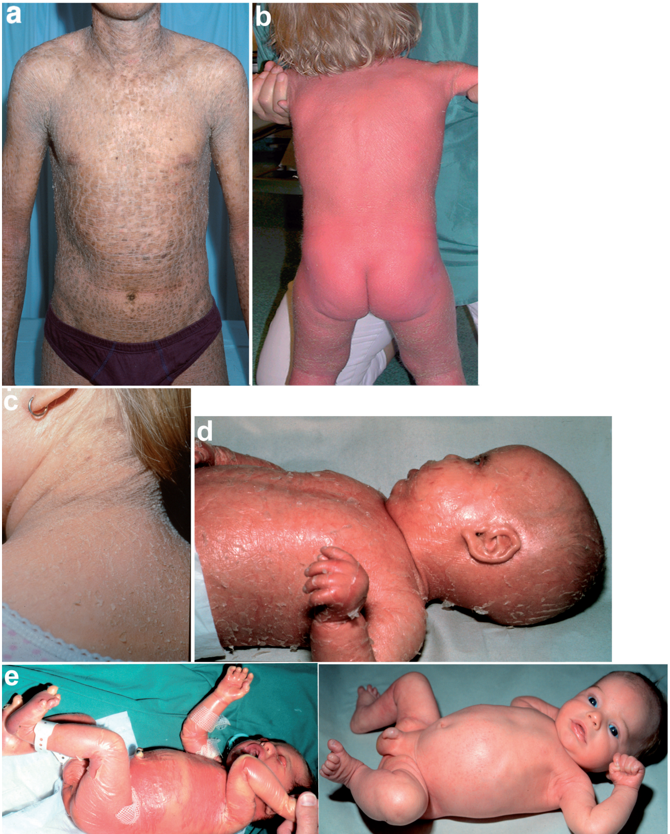
Fig. 1. Clinical characteristics of a) lamellar ichthyosis (LI), b) congenital ichthyosiform erythroderma (CIE) or erythrodermic ichthyosis (EI), c) congenital ichthyosis with fine or focal scaling (CIFS), d) Harelquin ichthyosis (HI)-related phenotype in infancy after shedding of the armour of scales covering the body at birth (note the malformed fingers and ear), and e) self-healing collodion baby (SHCB) soon after birth ( left ) and at 2 month of age ( right ). Later in life this boy showed dry skin and a very fine scaling on some parts of the body, i.e. self-improving collodion ichthyosis (SICI). From ref 4 with permission.