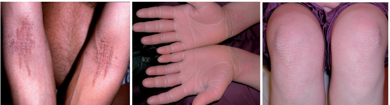
Fig. 3. Clinical characteristics of keratosis linearis, ichthyosis congenita, and keratoderma in a male aged 30 and in a woman aged 20 with mild ichthyosis on the extremities clearly accentuated on the knees and elbows. They were both born with generalized ichthyosis.

KLICK (MIM #601952) is a rare disorder of keratinization of the skin, characterized by mild ichthyosis, sclerosing palmoplantar keratoderma with constricting bands around fingers, flexural deformities of fingers and keratotic papules in a linear manner on the flexural side of large joints (Fig. 3). Affected individuals are usually born with a generalized EI of mild to moderate type, which soon changes into a mild CIFS, but the linear lesions and keratodermas progress gradually