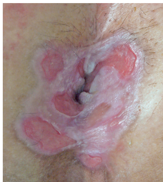
Fig. 1. Clinical manifestation. Ulcers on a well-demarcated plaque around the anus.

Physical examination revealed several ulcers and blisters on a well-demarcated, 5-cm plaque around the anus (Fig. 1). No skin lesions had appeared elsewhere on his body during the previous more than 3 years and the oral and ocular mucosae were not affected. Pruritus was absent, but defecation was painful. The rectal mucosa was unaffected and anal function was normal. A full blood count and tests of liver and renal function revealed no significant abnormalities, although the patient's HbA1c level was slightly raised (6.0%; normal range 4.3–5.8%).