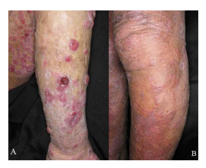
Fig. 1. Multiple red erosive plaques and tumours with confluence on the patient's extremities (A). After treatment with total body electron beam therapy followed by pegylated interferon, the tumours disappeared (B).

A 72-year-old Japanese woman visited us with a 2-month history of numerous asymptomatic tumours developing on her trunk and extremities. She had a history of parapsoriasis en plaque from 10 years before. Physical examination disclosed multiple erosive plaques and partly confluent tumours on almost her whole body (Fig. 1A). Moreover, she had lymph node swelling in her inguinal, axillary and cervical regions. A full blood count and biochemical profile revealed slight anaemia (Hb 11.2 mg/dl)