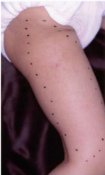
Fig. 1. An extensive linear skin lesion in right thigh and buttock.

Melorheostosis is a rare sclerosing dysplasia wherein the affected bone demonstrates a cortical or endosteal hyperostosis, characterized roentgenographically by the appearance of dripping candle wax (6–8). Since its original description in 1922 by Leri & Joanny, more