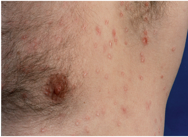
Fig. 2. Typical skin lesions occurring all over the body.