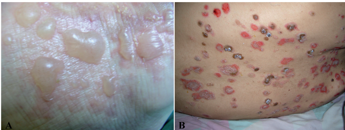
Fig. 1. Bullae (A) on the patient's foot, and (B) subsequently spread to the whole body.

The aetiology of pemphigus is still not exactly known. A strong association of pemphigus with Class II genes has been demonstrated (4, 6). Some drugs such as D-penicillamine have been reported to induce pemphigus. Because there were several reports of pemphigus occurring during pregnancy or with the use of oral contraceptives, hormonal factors have been suggested (7). The potential role of sunlight in the pathogenesis had also been hypothesized, but the mechanism is not clear (1, 4). Environmental factors were thought to be responsible in the aetiopathogenesis of the disease because of its epidemiological features in Brazil and a significant association between pemphigus and frequent exposure to black fly was found in a case-control study (8). Bastuji-Garin et al. (1) investigated patients with pemphigus regarding socioeconomic status, medical history, drug intake, lifestyle, and environment in a multi-centre case-control study in Tunisia. They identified a dose-dependent relationship between pemphigus and traditional cosmetics. In this study, while any association between exposure to black fly and pemphigus was not found, a significant correlation between wasp, bee and spider stings and pemphigus was also found (1)