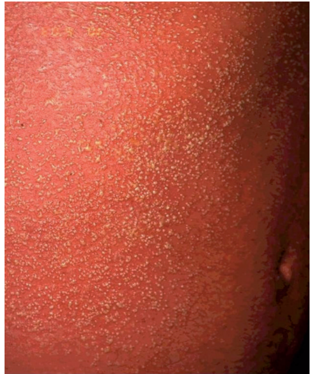
Fig. 1. Erythematous rash covered with non-follicular pustules.

A cutaneous biopsy showed subcorneal non-follicular pustules, epidermal spongiosis, focal keratinocytic necrosis and basal vacuolar degeneration. Papillary dermal oedema and diffuse perivascular infiltrates of