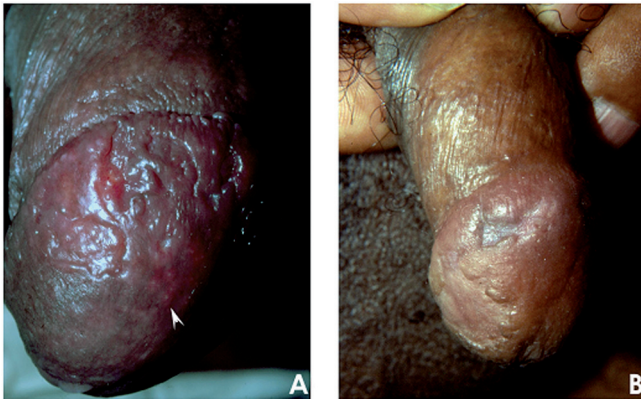
Fig. 1. (a) Case 1: multiple scabbed papules (arrow); proximally, presence of ulcers and scars. (b) Case 2: after treatment, showing typical irregular depressed scars.

The occurrence of penile tuberculids is a very rare but well-documented event (3, 5, 7–9). Most reports come from Japanese and South African authors (3, 5, 7, 13), suggesting a racial or environmental predisposition, but occasional patients have been seen in other countries (8, 9). To our knowledge, South American patients have not been reported so far.