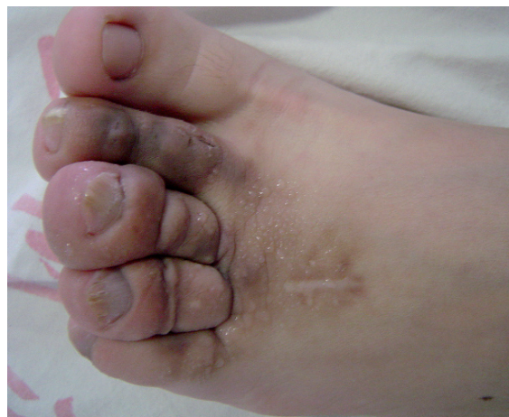
Fig. 1. A well-defined half 4×3 cm, triangle lesion on the dorsum of the foot. Except for the hallux, the other four toes are all deformed. The hyperhidrotic plaque is pigmented, tender and hypertrophic. The colourless, diaphanous, dewdrop-like sweat fully distributes on the surfaces of the lesion.

Informed consent was obtained from the patient prior to biopsy. A cutaneous lesion was excised deeply from the dorsum of the left second toe, rather than from the dorsum of the left foot. The tissue was fixed in formalin and embedded in paraffin, and 4 µm sections for light microscopy were stained with haematoxylin and eosin (H&E) and Alcian blue separately. The epidermis demonstrated hyperkeratosis, acanthosis and focal pigment granule of the basal layer. The tissue showed an unremarkable superficial dermis. In the deep dermis, however, proliferation of lobulated eccrine glands, an increase in the number of intradermal eccrine ducts and eccrine coils composed of normal secretory and ductal portion were revealed (Fig. 2A). The nature of this lesion can be fully appreciated at higher magnification (Fig. 2B). The Alcian blue stain performed at pH 2.5 strongly highlighted a deposit of abundant mucinous