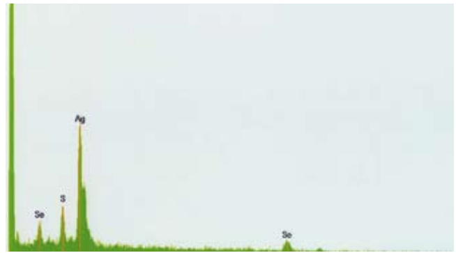
Fig. 3. Spot X-ray microanalytical spectrograph. Note the prominent silver peak (Ag).

Potassium iodide, metal chelating medicine, glutathione administered internally, and injection of brine are used for the treatment of argyria; however, so far none of these treatments have resulted in any significant improvement. Avoiding the causative agent is the most important aspect of treatment (8). Although our case just kept away from sunlight, she showed some improvement, and no aggravation was observed after ceasing silver protein for antiseptic.