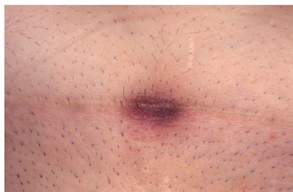
Fig. 1. A red, tender, subcutaneous mass in the midline of the vertical caesarean scar. The overlying skin was normal.

Recently, Francica et al. (8) reported that the use of sonographic and colour Doppler examinations, in