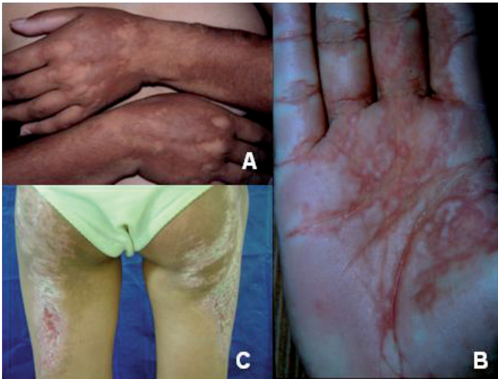
Fig. 1. (A) Brownish plaques on the dorsal side of the forearms of case 1. (B) Palmar lesions with diffuse infiltration sparing the palmar crests in case 1. (C) Erythematous and squamous plaques on the buttocks of case 2.

improvement in the texture and dimension of the skin lesions. After one year of follow-up there were no active lesions and no new plaques.